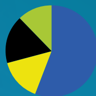
Total Expenditure by Category $1,042.9 million